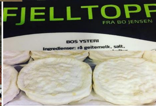
kokketina Fantastisk Fjelltopp ost @bo1jensen 😊 @restaurant1877bergen 🇳🇴