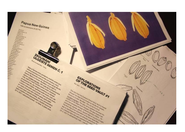
The project takes its inspiration from the beginnings of modern botany and empirical natural sciences from the 18^{\text{th}} and 19^{\text{th}} century, such as detailed illustrations of seeds.

ongoing results of research into the freely accessible seed database at the Svalbard seed bank . The artists focus mainly on visualization of various aspects of data, making it possible to view information in new contexts. Visitors can thus see a video recording in which the artists present the project and its objectives, examine a