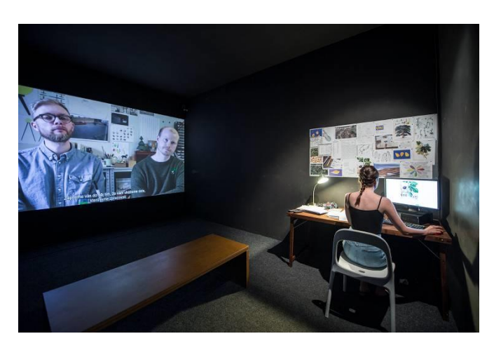
The exhibit is a work in progress that is gradually transformed and supplemented as time passes.

The on-line residence format emphasizes a process-oriented and open approach, and refers to the theme of the Big Bang Data exhibition, i.e. to the digital age and its consequences. For the project's authors, the on-line environment becomes natural: through the screen, Jørn Knutsen and Einar Sneve Martinussen meet both with the subject of their research and with exhibition visitors.